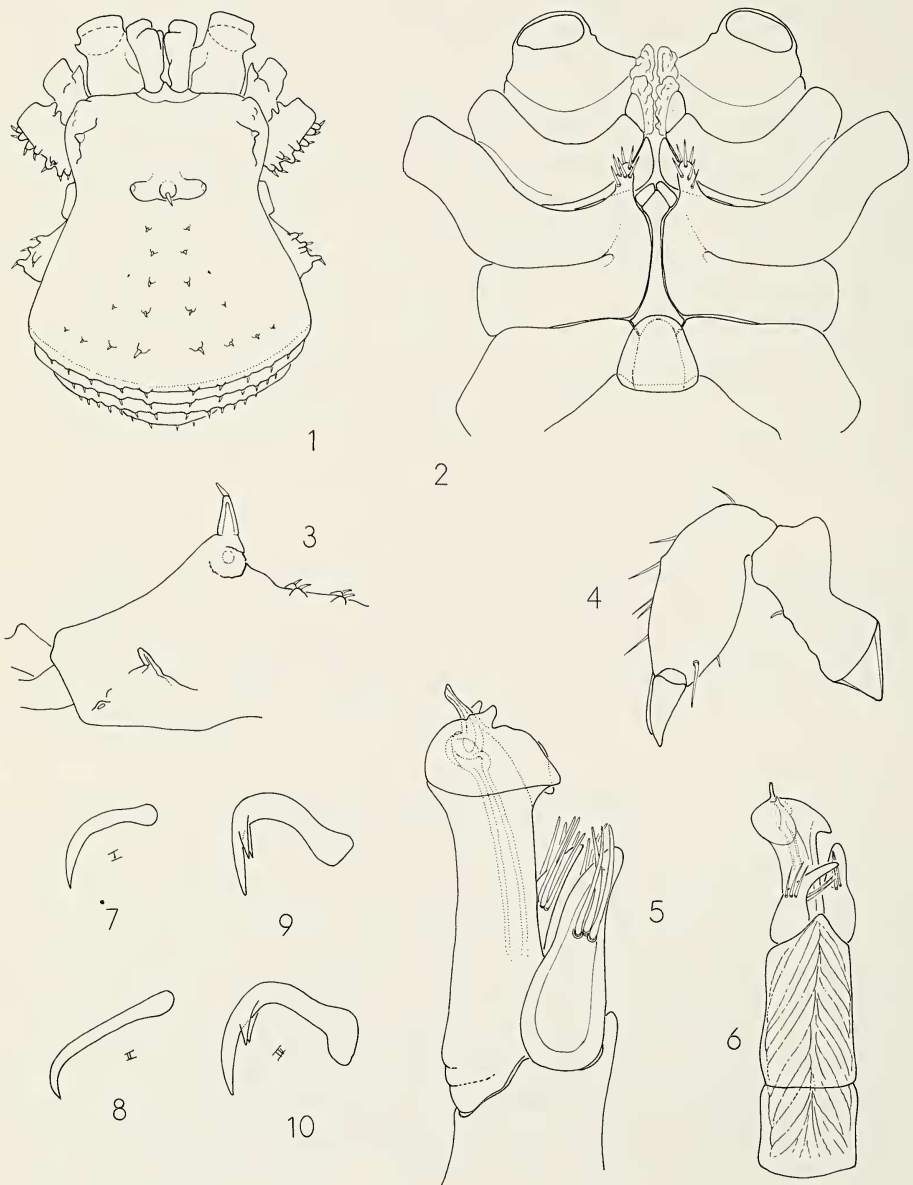
Figs. 1-10.—Anatomy of Fumontana deprehendor : 1, body of male, dorsal view; 2, anterior ventral region of male, ventral view (semidiagrammatic, setae and spined tubercles omitted); 3, anterior part of body of male, lateral view; 4, chelicera of female, lateral view; 5, penis, lateral view; 6, penis, subventral view; 7-10, claws of legs: 7, leg I; 8, leg II; 9, leg III; 10, leg IV.

11. Legs: Leg I with femur bearing spined tubercles twice as long as width of segment, similar tubercles reduced on distal segments (Fig. 13). Leg II (Fig. 14) similar to leg I, but tubercles of femur shorter. Leg III (Fig. 15) with spined tubercles further reduced, astragalus with large spined tubercle dorsally overhanging calcaneus. Leg IV (Fig. 16) with femur slightly sigmoid, small spined tubercles on dorsal side, ventral side slightly and